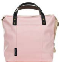
Tote Bag with Zip