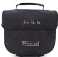
Mini O Bag