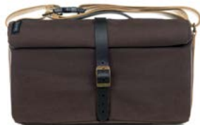
Roll Top Bag